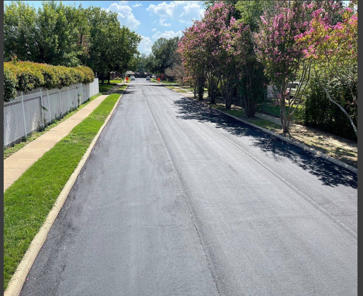
Irving, TX 2022