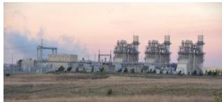
Delta Energy Center - 2016