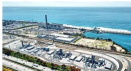
Encina Power Plant - 2017