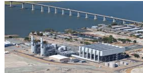
Gateway Generating Station - 2013