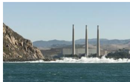
Morro Bay Power Plant - 2014