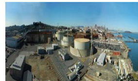
Potrero Generating Station - 2011