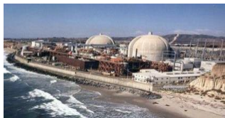
San Onofre Nuclear Generating Station - 2012