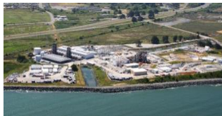
Humboldt Bay Power Plant - 2010