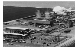
Daggett SCE Cool Water Gasification Plant - 1998