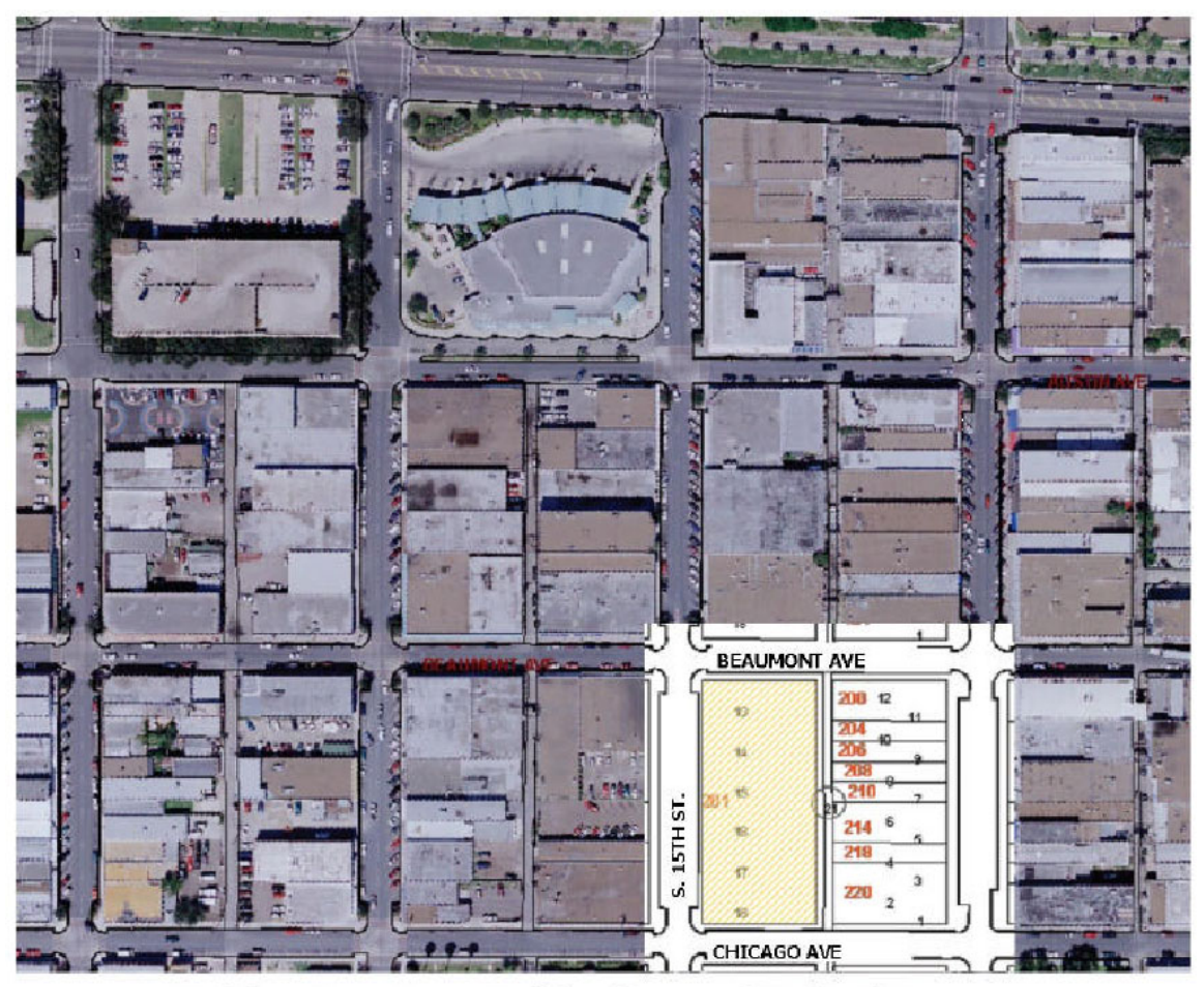
EXHIBIT A AREA MAP