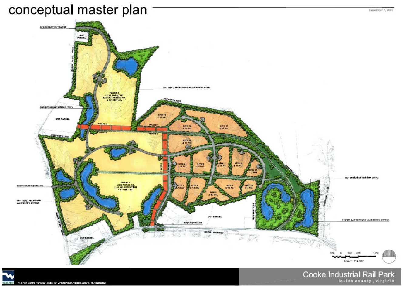
Exhibit B Cooke Industrial Business Park Concept Plan

The 2012 proffer amendments were approved to align the original proffers and proposed future development with the newly adopted 2012 Comprehensive Plan and Transportation Plan that would change the main access to the industrial park and to also provide for uses by issuance of a conditional use permit that were originally excluded.