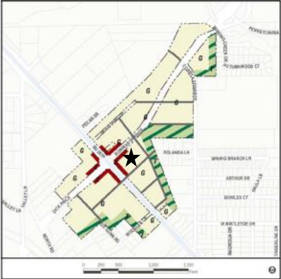
Figure 5-3 Crossroads Urban Village Regulating Plan