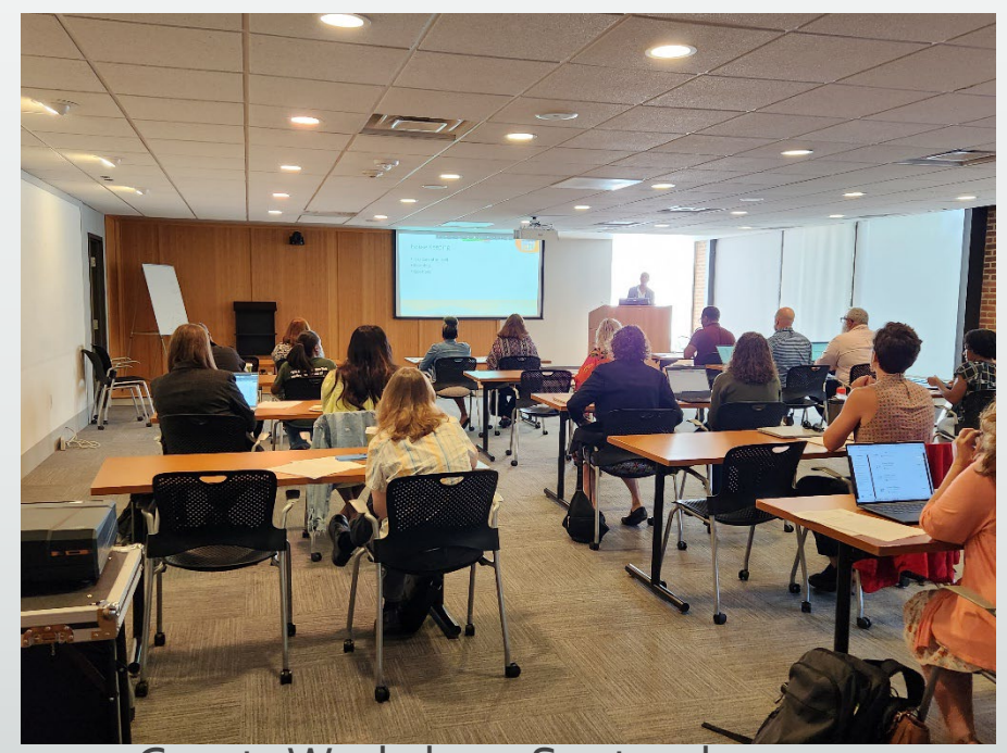
Grants Workshop, September 12, 2023