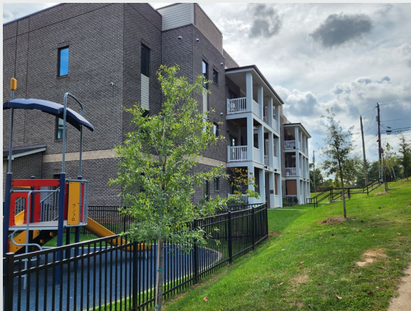
South 1st Street