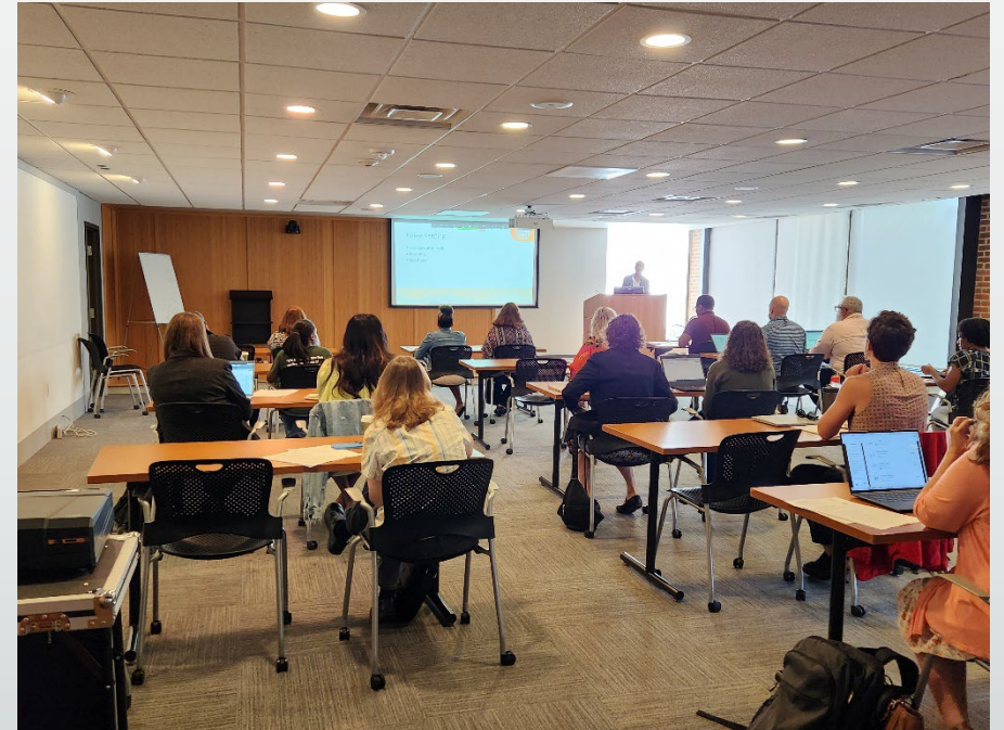
Grants Workshop, September 12, 2023