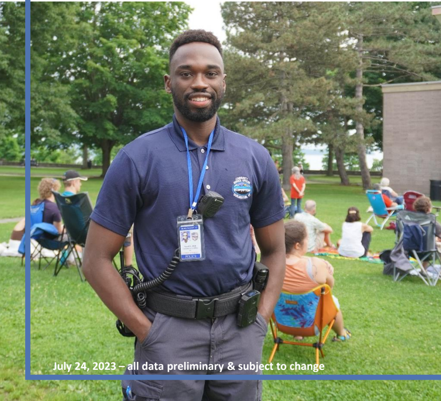
July 24, 2023 – all data preliminary & subject to change